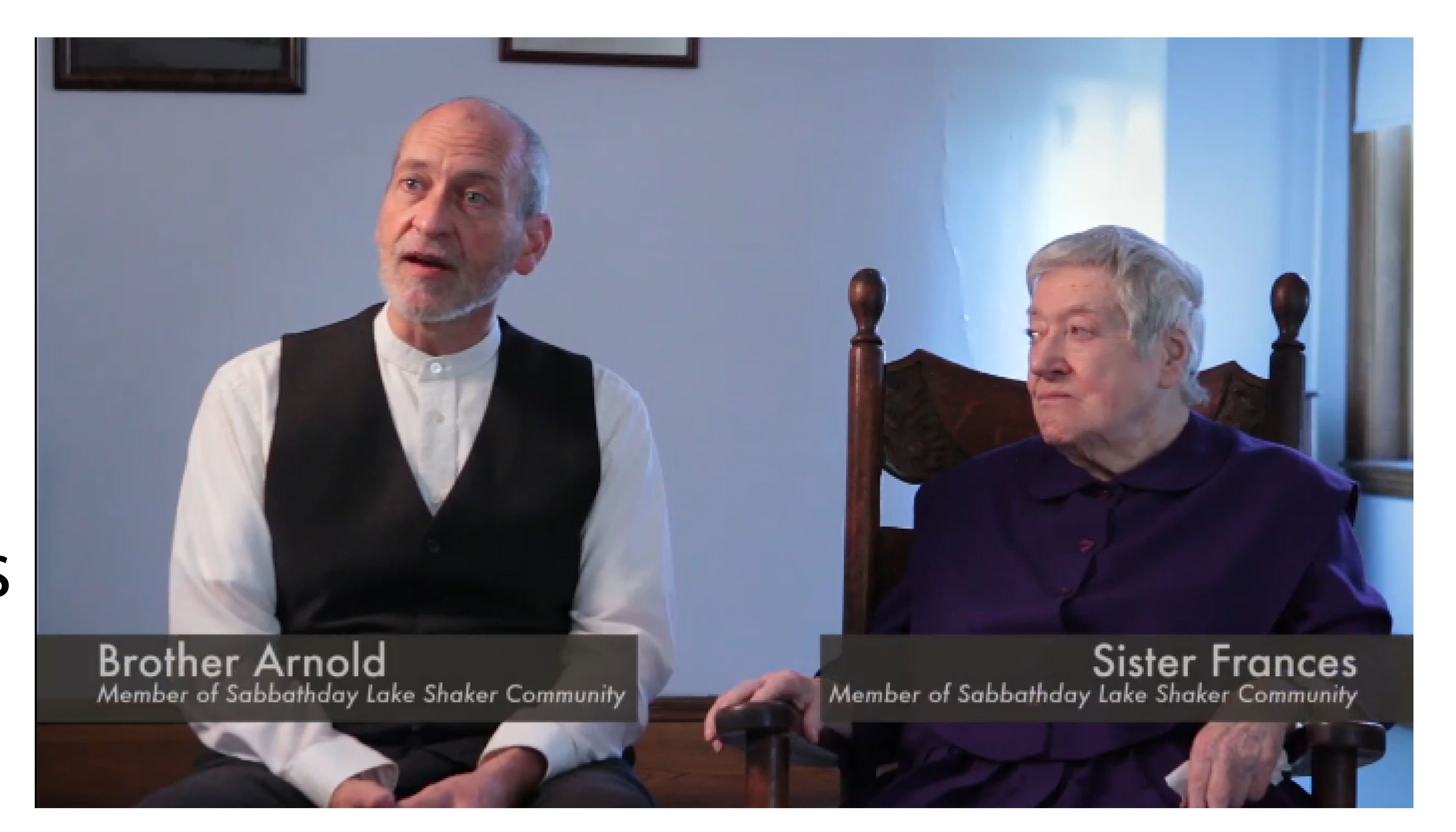
Last remaining members of the Shaker religion.

Many people believe the reason for Shakerism's failure is due to their practice of celibacy and strict separation of the sexes in their daily lives and activities. But many other ninetieth-century communes also had issues with recruiting and retaining of members, which suggests the fall of Shakerism is