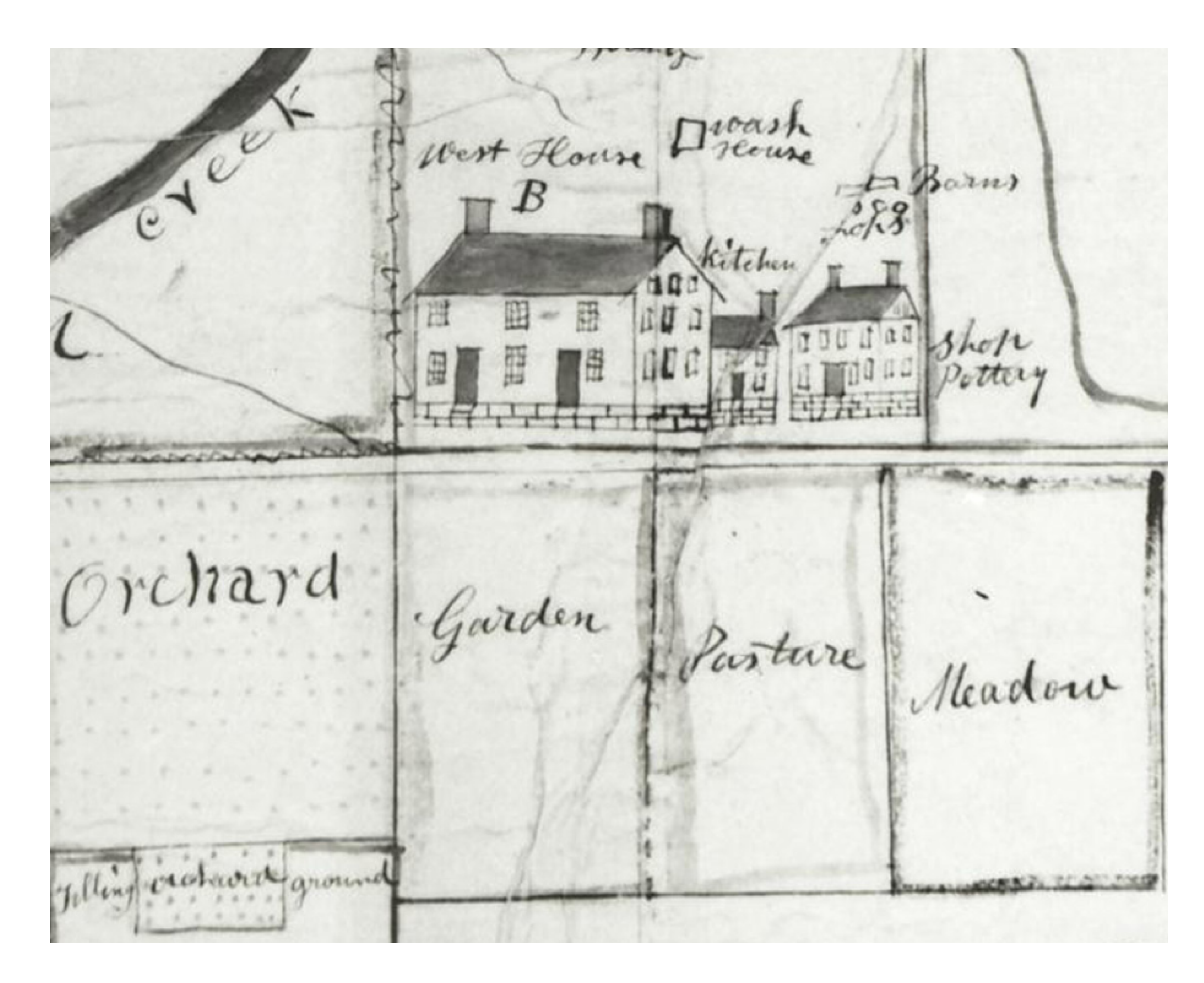
1829 map rendering of West Frame lot.