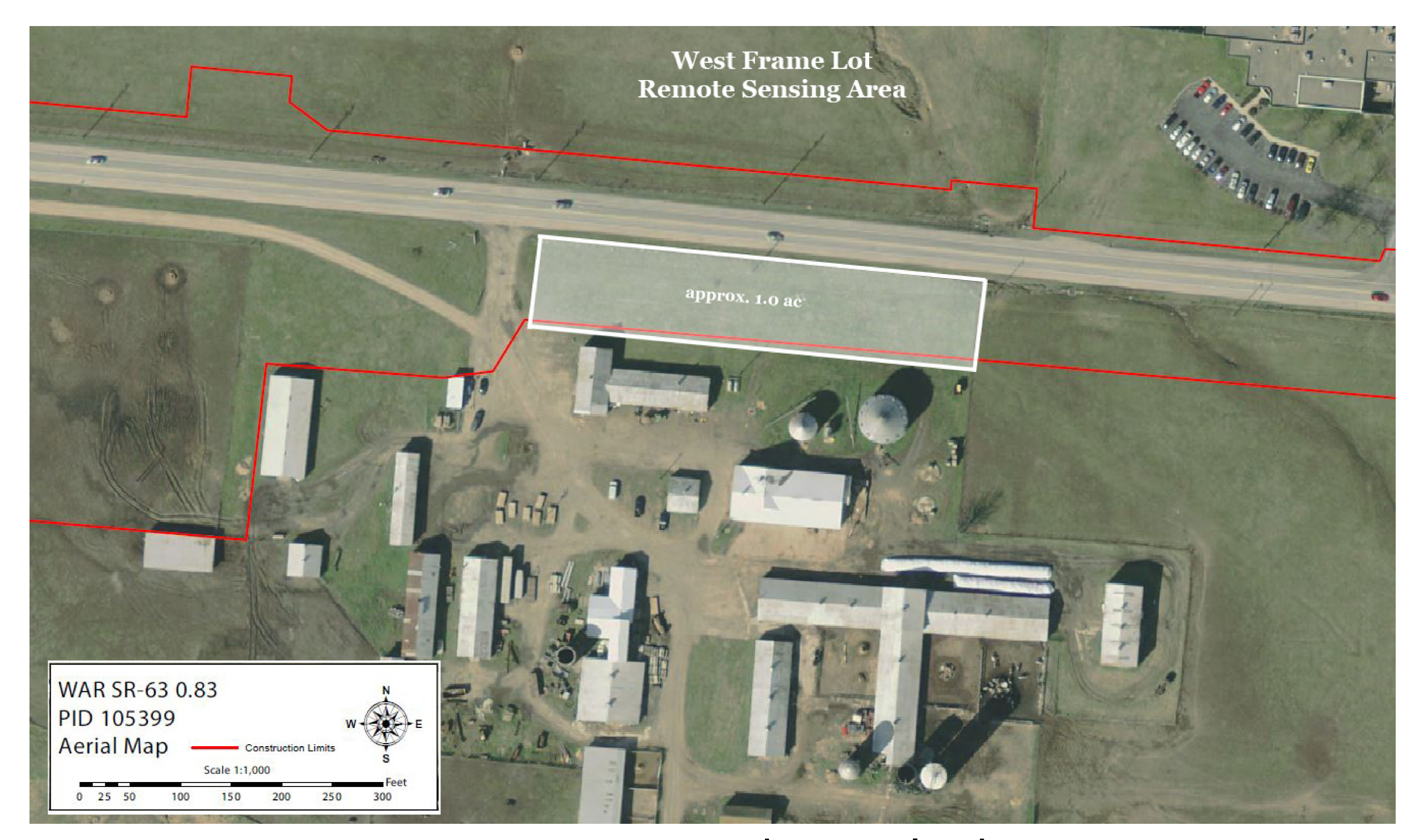
Remote sensing study area looking for West Frame lot remnants.

We are in the process of searching areas that may be disturbed by the widening of SR 63. Some areas of concern have already been identified. Field work is underway to further understand the project's potential impacts to Shaker remnants.